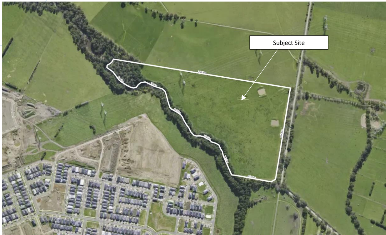
FIGURE 1: AERIAL OF SITE