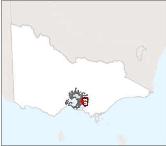
Part of Planning Scheme Map 11PAO