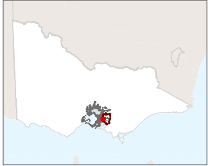
Part of Planning Scheme Map 11HO