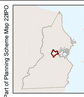
Part of Planning Scheme Map 22IPO