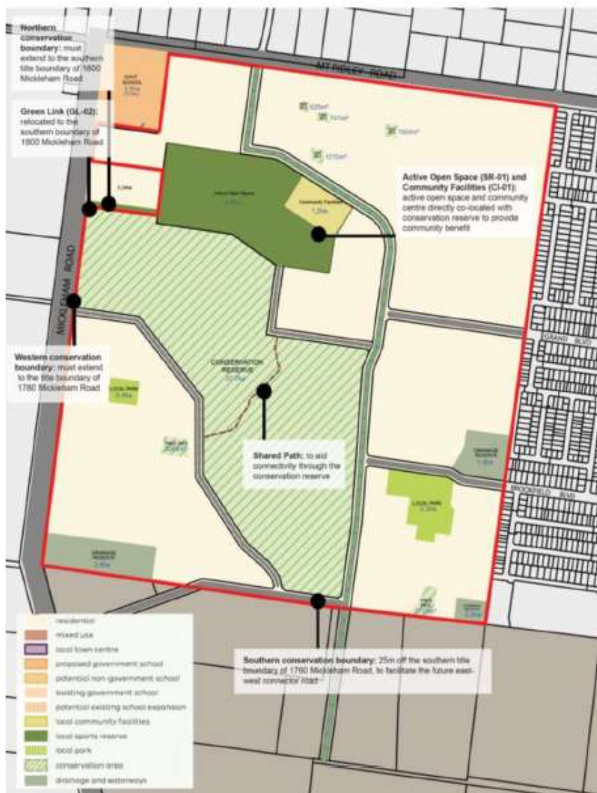
Figure 1: Proposed Place Based Plan demonstrating Conservation Reserve boundary amendment and subsequent co-location of the Active Open Space and Community Facilities.