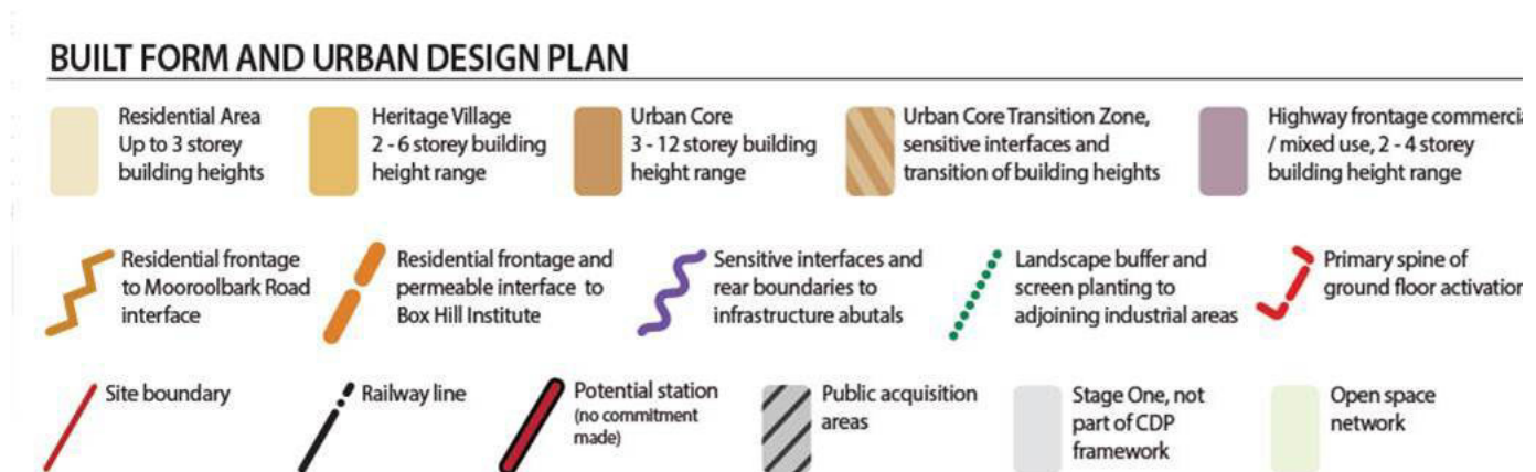
Figure 8: Built Form and Urban Design Plan

There is no State government housing proposed at this point. The type of affordable housing is yet to be determined via an agreement with Council.