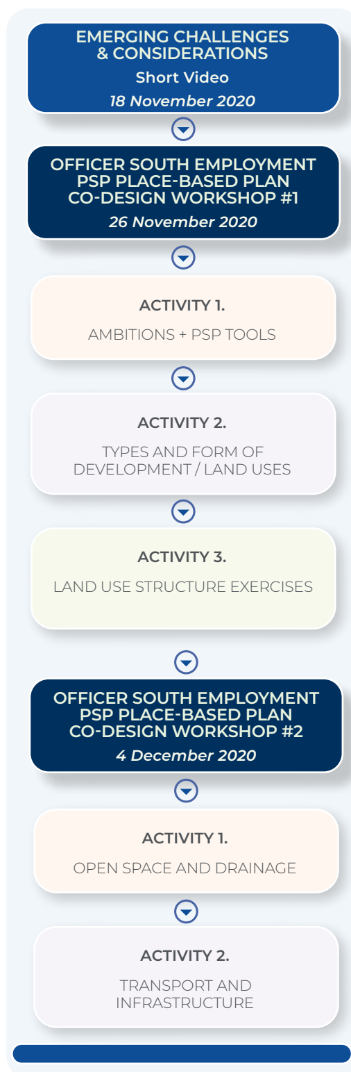
Figure 2 Workshop Schedule

The output data recorded on MURAL during the workshops are included as Appendix 1 and 2.