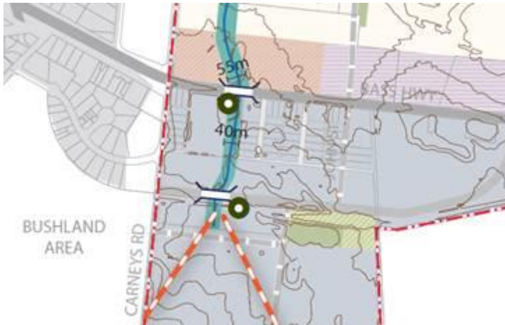
Figure 1 Extract of plan 9 of the Proposed PSP