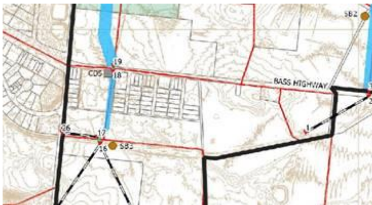
Figure 2 Extract of plan from Engeny Drainage Strategy.

We look forward to your response and reserve the right to be heard at any subsequent panel hearing.