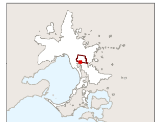
Part of Planning Scheme Map 20DDO