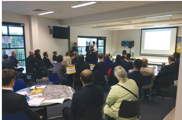
Presentation at the Business Forum at North Melbourne Football Club, October 4.