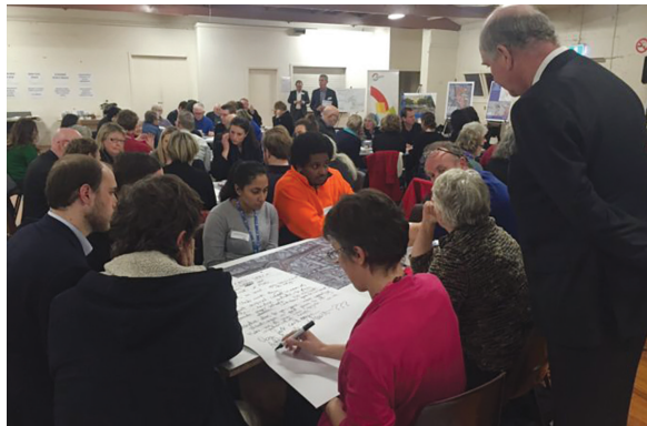
Group discussion at the Arden community forum, October 5.