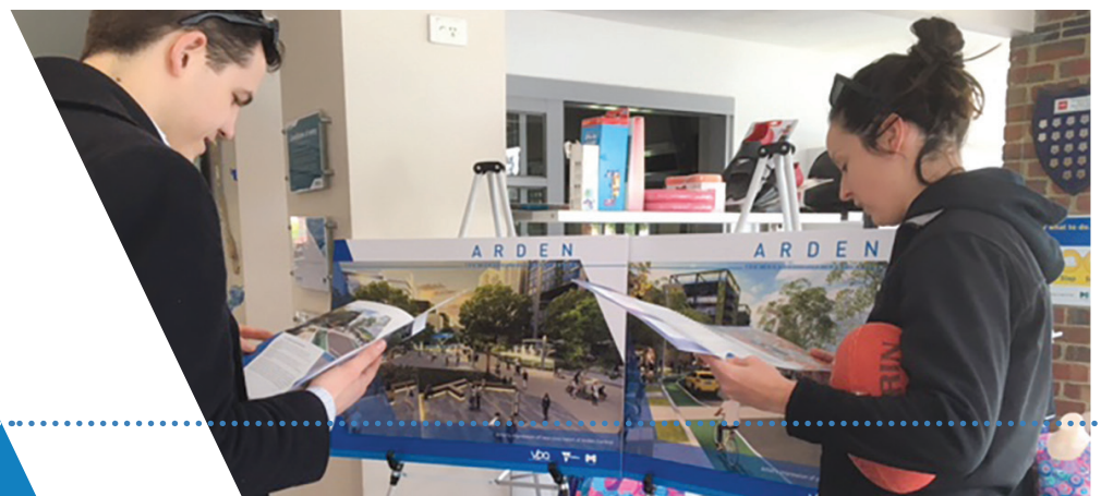
Community member engagement at the North Melbourne Pool, October 1.

Over six weeks, the VPA ran numerous community and stakeholder events and an online survey to explain the details of the project and capture participants' views. The vast majority of survey respondents stated that all principles identified by the VPA for guiding the area's transformation were 'important' or 'very important'.