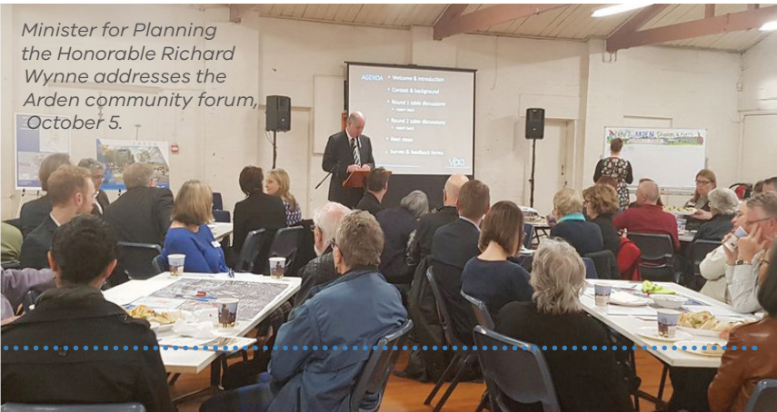
Minister for Planning the Honorable Richard Wynne addresses the Arden community forum, October 5.

4000 FLYERS PUT IN HOUSEHOLD AND BUSINESS LETTERBOXES AROUND ARDEN