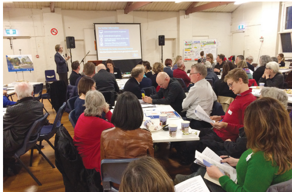
Arden community forum, October 5.