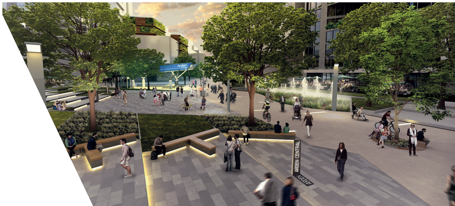
Artist's impression of new civic heart of Arden Central

Contact for more information about key projects in the area