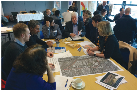
Discussion at Business Forum at North Melbourne Football Club, October 4.