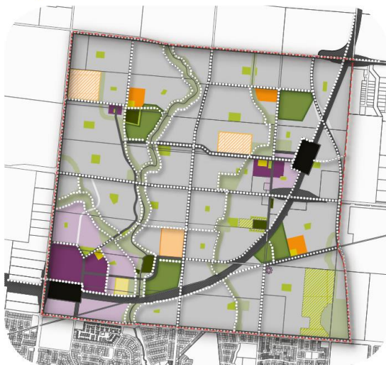
Plus off-road trail network