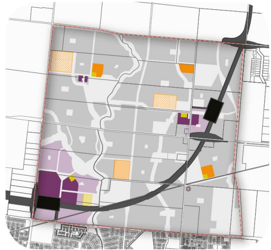
Plus schools and community facilities