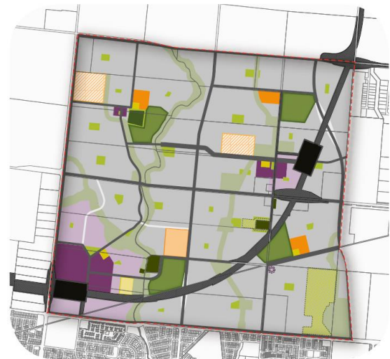
Plus open space system