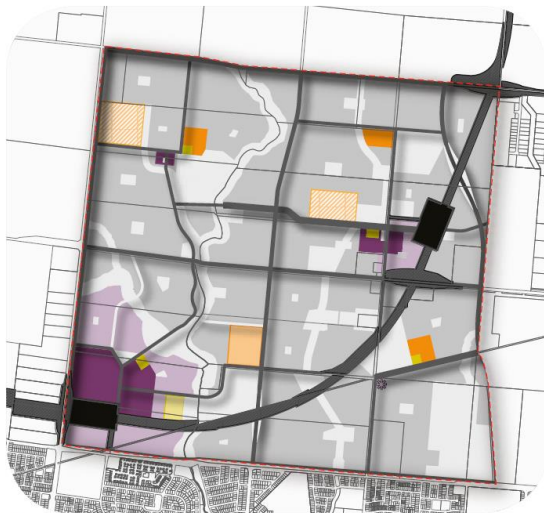
Plus permeable road network