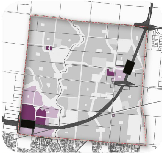
Rail, station and town centres

Graphic depicting the layering of key precinct and infrastructure features leading to an integrated structure (Truganina PSP approved 2014)